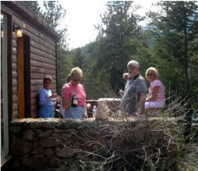
Champagne party on Bucklin cabin patio.