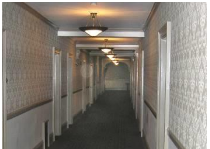
Ghostly "orb" in most haunted floor in Stanley Hotel