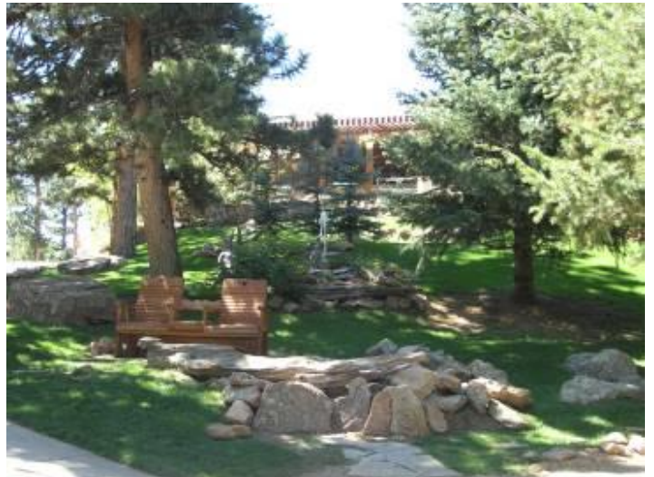
View of the lodge from poolside.