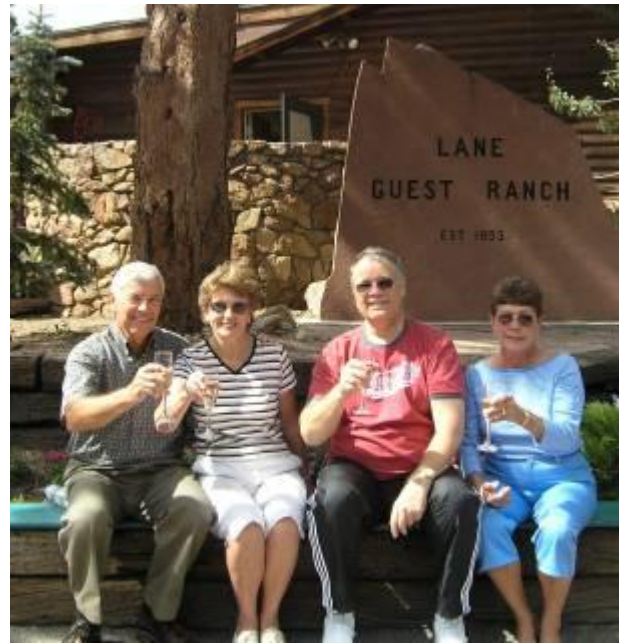
Welcome Champagne Toast at side of Lodge.