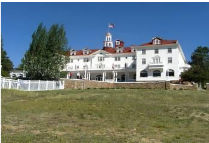
Haunted Stanley Hotel in Estes Park - used for "The Shining" by Stephen King.