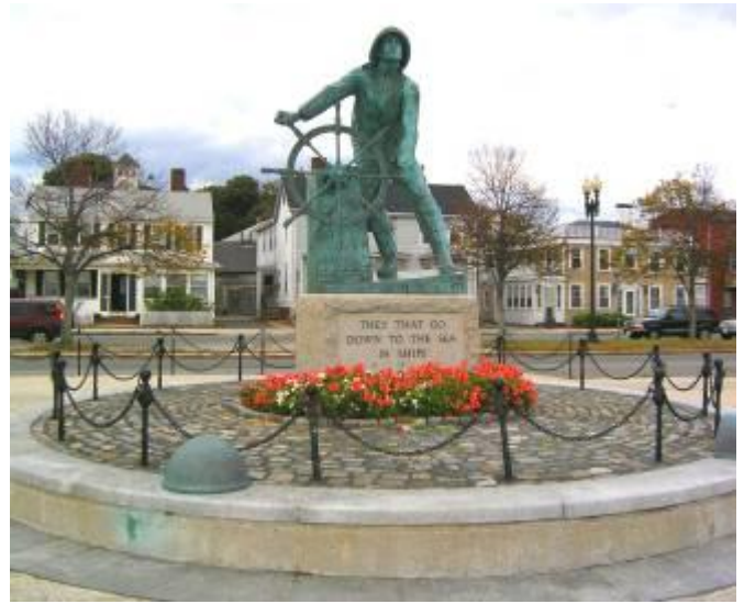
We looped around and head south through the White Mts and rain in New Hampshire and ended in Gloucester, Mass.