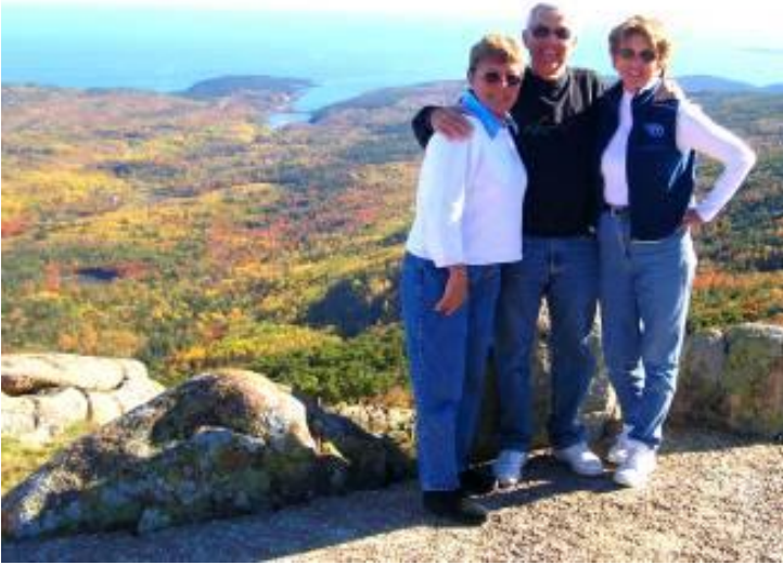
We climbed 1000 feet up Mt. Cadillac and looked down on the coast and Bar Harbor.