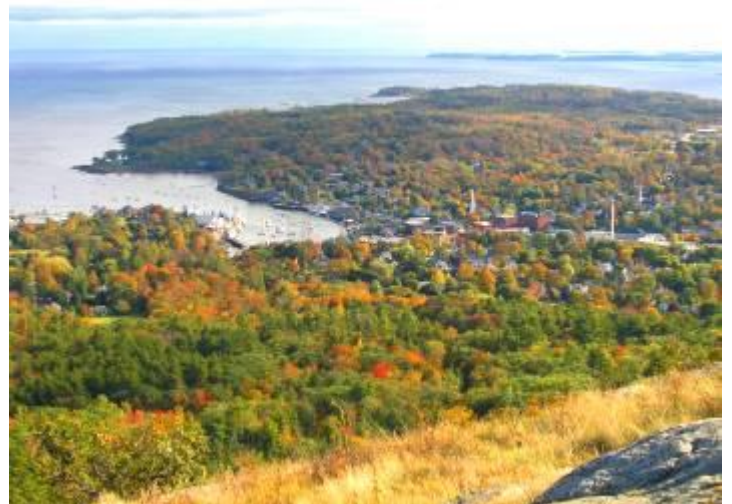
Camden is especially scenic viewed from its tiny little port and from the mountains behind.