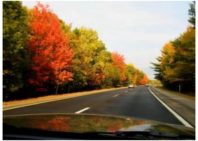
Our first trip was by ferry to Peaks Island where we rented bicycles and got a special treat of Maine culture. Then we head out along the coast to inhale the spectacular fall colors.