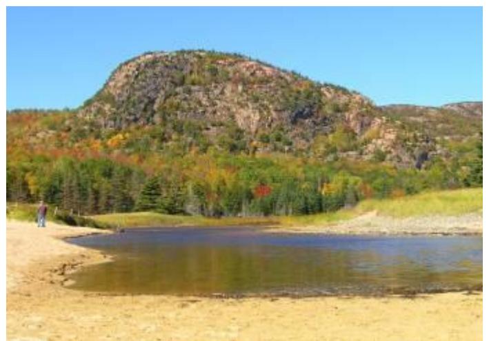
Acadia National Park on Mt. Desert Island with its unique blend of natural beauty was our destination.